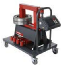
38 ZFD cap. 300kg

BETEX® is a registered trademark of Bega Special Tools