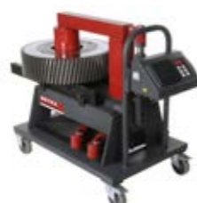
40 RMD cap. 600kg