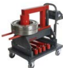
40 RSD cap. 350kg