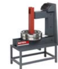
SUPER cap. 600kg