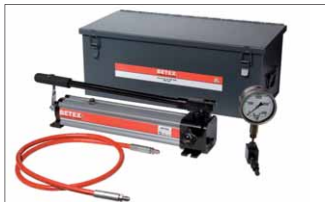
Handpumpset UHP 2800