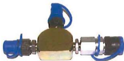
T-1547 Tee Block