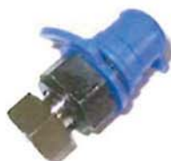
T-1553 Blank Nipple