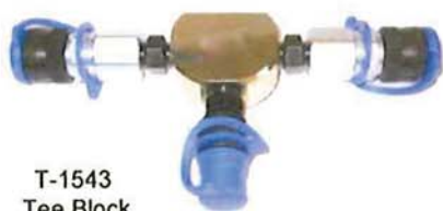
T-1543 Tee Block

Special assemblies can be made to your specified requirements. Please send details of your requirements for a fast response.