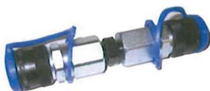
T-1551 Gender Changer