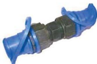
T-1552 Gender Changer