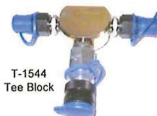
T-1544 Tee Block