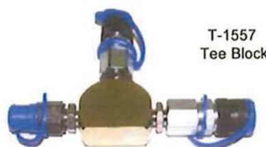
T-1557 Tee Block