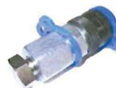
T-1554 Blank Coupling