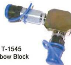
T-1545 Elbow Block