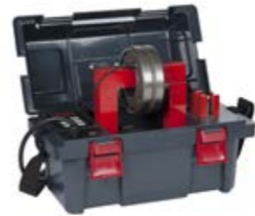
Induction heater Betex portable BETEX BLF 200