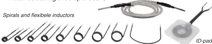
Spirals and flexibele inductors