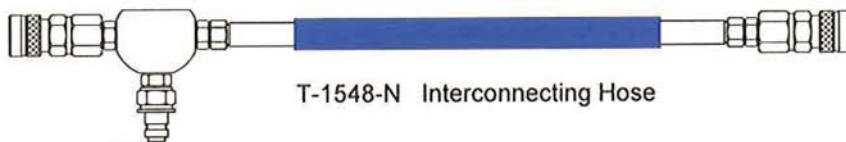
T-1548-N Interconnecting Hose