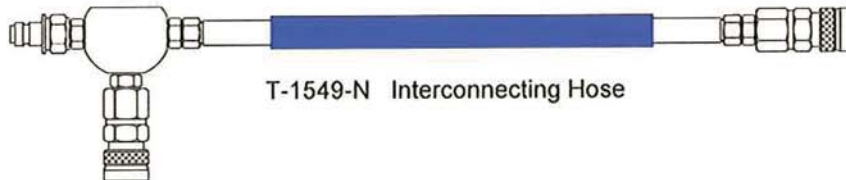
T-1549-N Interconnecting Hose