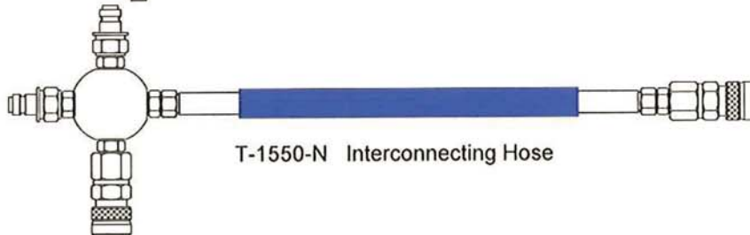
T-1550-N Interconnecting Hose