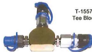
T-1557 Tee Block