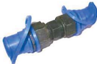
T-1552 Gender Changer