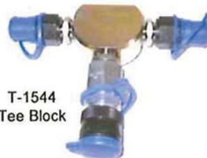
T-1544 Tee Block