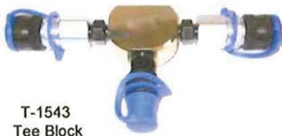
T-1543 Tee Block

Special assemblies can be made to your specified requirements. Please send details of your requirements for a fast response.