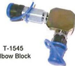
T-1545 Elbow Block