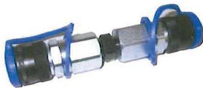
T-1551 Gender Changer