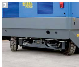
2 4 wheels. Rear wheels traction axle.