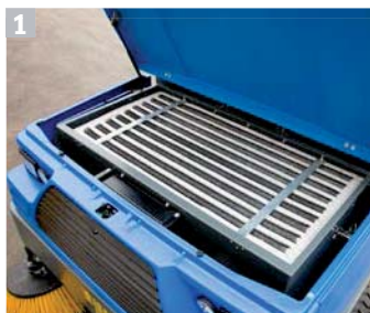
1 Textile polyester pocket filter.