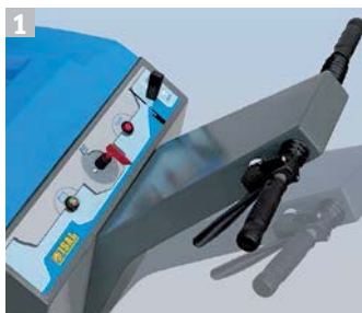
1 Easily directionable handle. 2 HONDA 4 Hp gasoline engine.